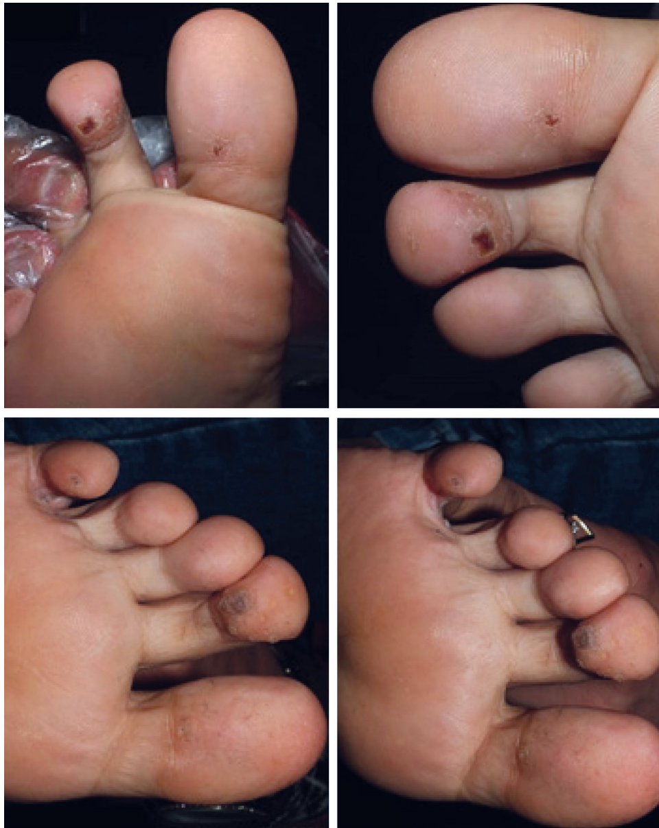
Figure 3. A 25 years old woman after first and second time treatment.

12 (21.4%) needed the third, 10 (17.9%) the fourth, and eight (14.3%) did not recover after the fourth treatment. The recovery rate was 21.4% with one treatment, 45.4% with two, 66.8% with three, and 85.7% with four (Figure 4).