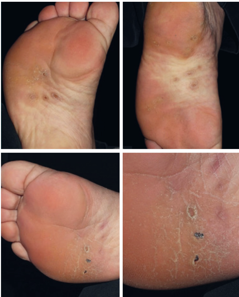
Figure 2. A 54 years old man after first and second time treatment.

Thirty-six patients (81.8%) under 30 years of age and 12 (100%) over 30 years had a complete response to treatment, although the difference between them was not significant ( P = 0.111 ). The patients were assessed according to their monthly visits, and the decision for re-treatment was made based on the examination of the wart. The patients were treated in a maximum of four sessions. The mean frequency of treatment was 2.5 \pm 1.2 times. Twelve patients (21.4%) recovered after the first treatment; 14 (25%) needed the second treatment,