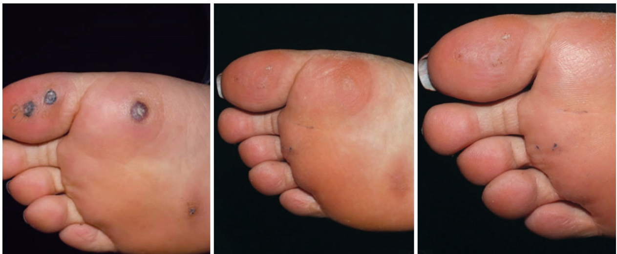
Figure 1. A 28 years old woman after first and second time treatment.

In the present study, 60 patients with treatment-resistant plantar warts underwent treatment with bleomycin tattooing combined with TCA and shaving. Four (6.7%) were excluded for loss to follow-up, and 56 patients (93.3%) in total were assessed, of whom 32 (57.1%) were men and the rest were women. In terms of age, 44 (78.5%) patients were under 30 years of age and the rest were over